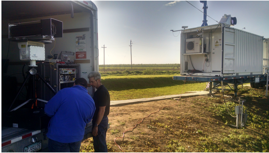
Figure 2: SAMPLE on the left and REAL on the right during a side-by-side comparison experiment on 9 March 2015 in Chico, California.